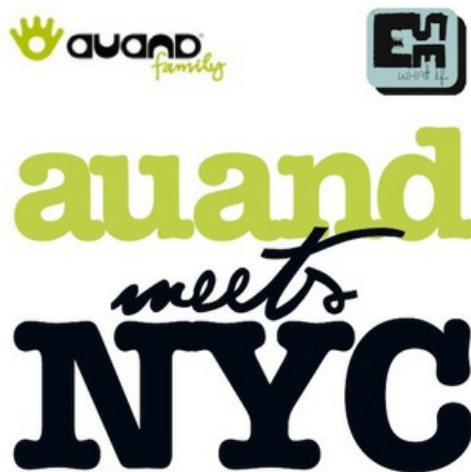
Apulian record label Auand Records celebrates its first 10 years.