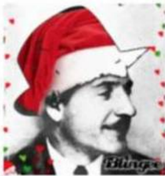
Mock-up "Pete Panto Santa Card"